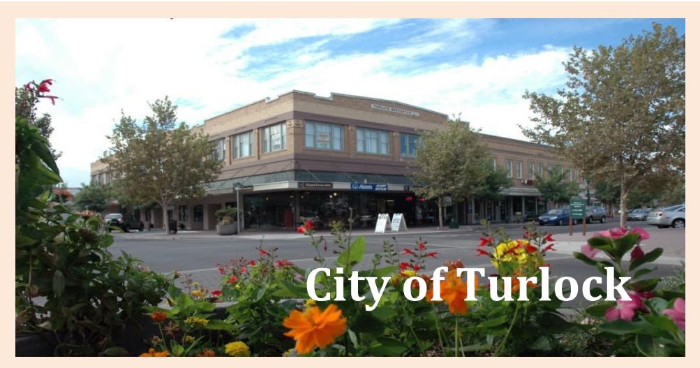
Turlock: 3rd Quarter 2018 Sales Tax Capture & Gap Analysis Report Percent of Potential Sales Tax: Less than 100% indicates Leakage and more than

2018Q3 Taxable Sales $ 443.2 million 2017Q3 Taxable Sales $ 370.7 million Percent Change 19.6%